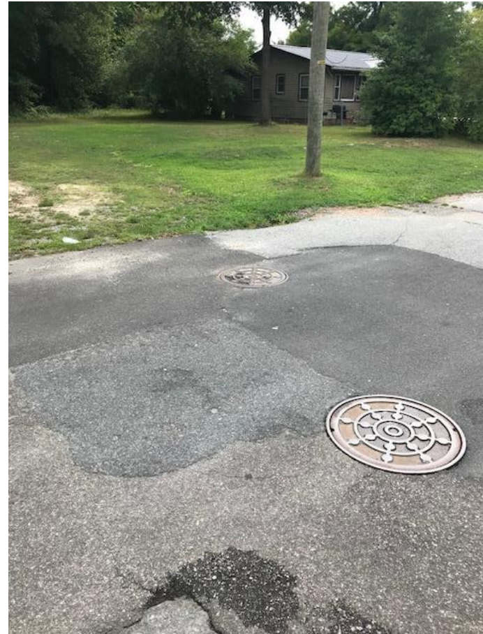
Goldsboro Sewer Infrastructure