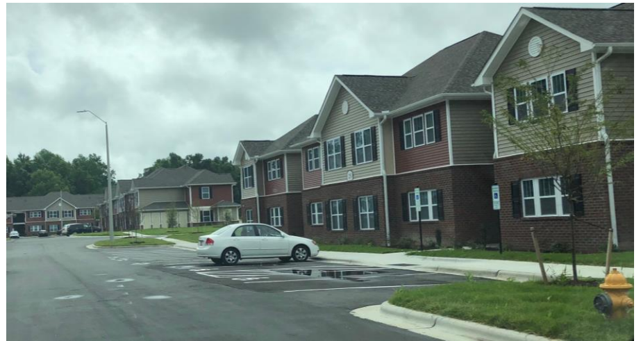
Tabor Landing Apartments