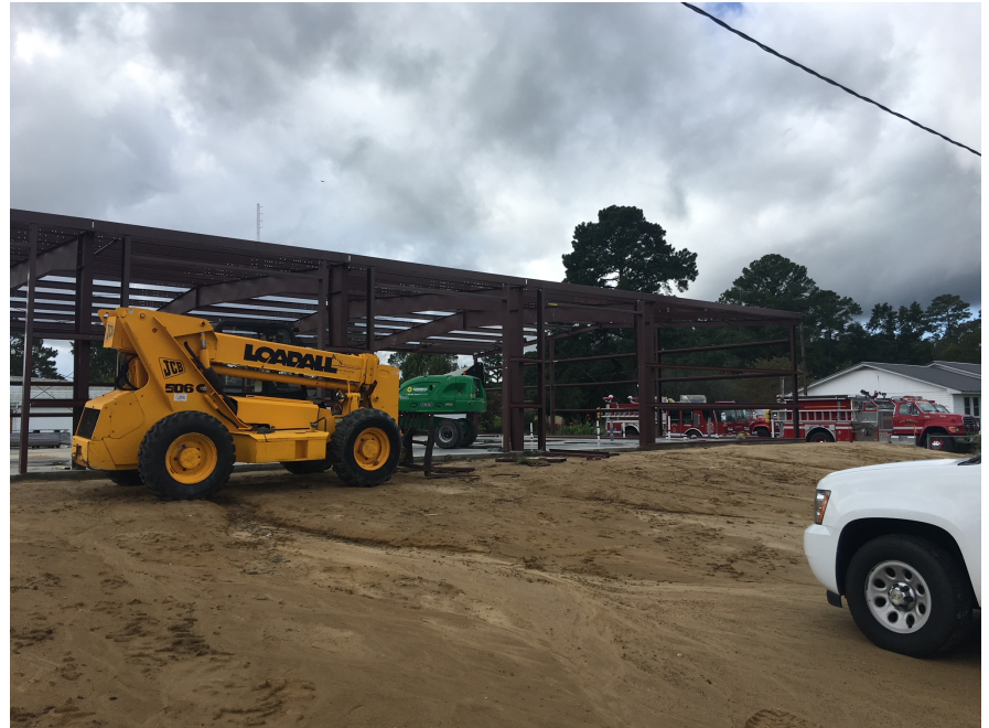
Pine Terrace Fire Department, Lumberton