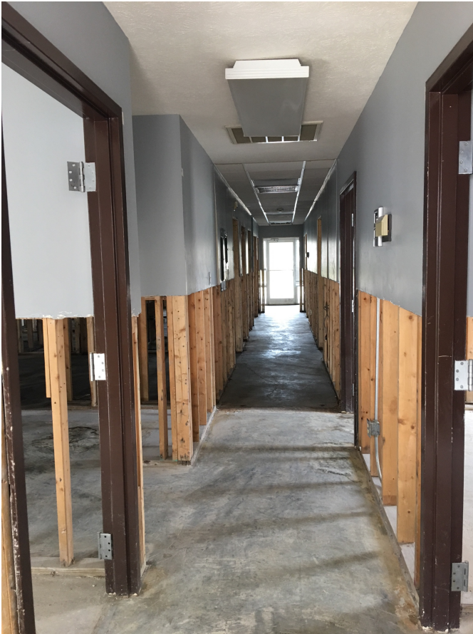
Lumberton Public Works