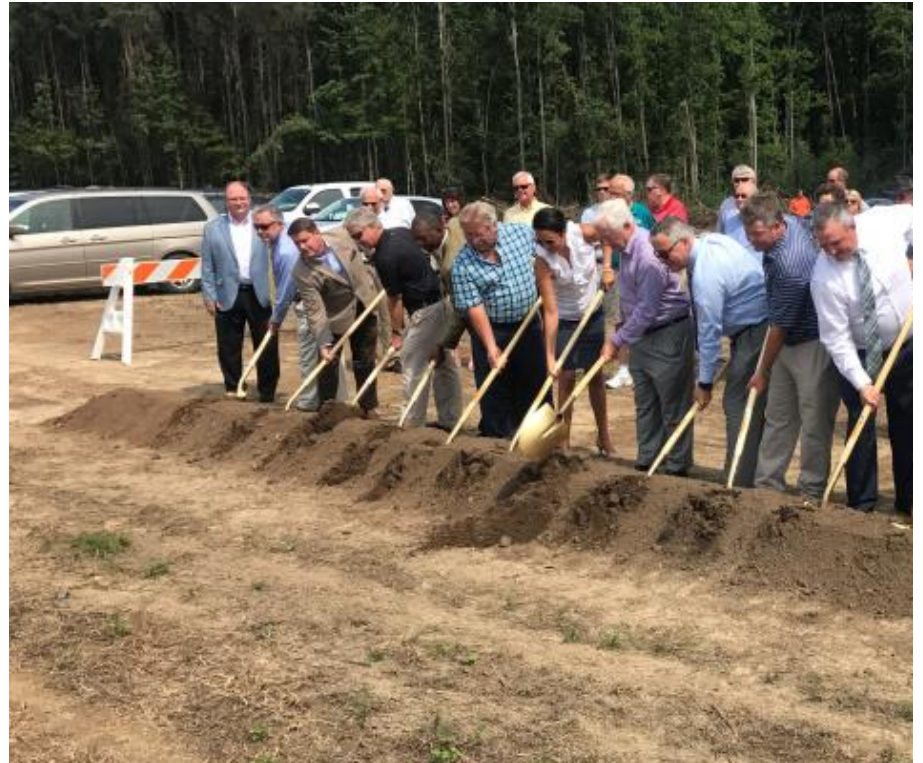
Tabor Landing Groundbreaking, July 25, 2017