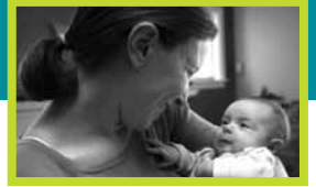
Figure 1 The Gap in Children's Language Ability Begins Early