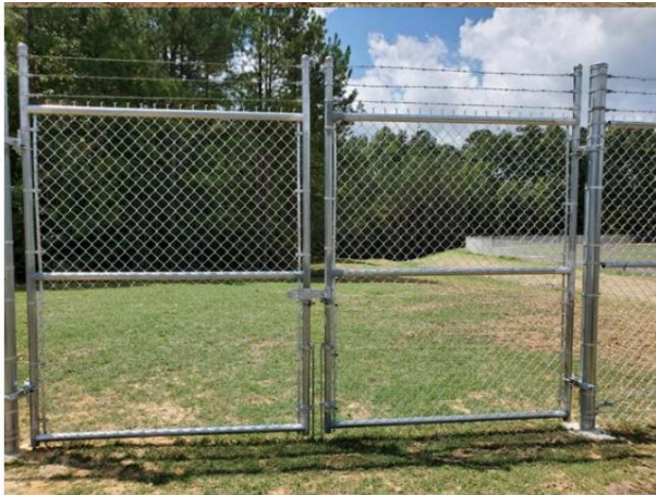
Gate installations. Look good, still need anchor blocks installed