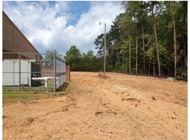
Tree clearing alongside Auditorium