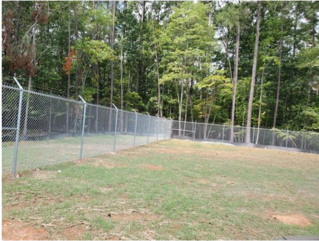
Fencing with Fabric installed

The following photos were among those submitted as part of Timmons Group's (fencing) site visit report on 17 August 2023: