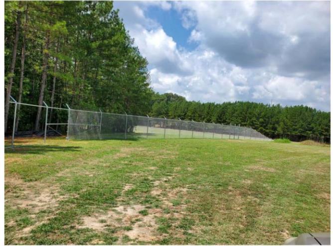
Fence Fabric and fencing progress in region of baseball field / track