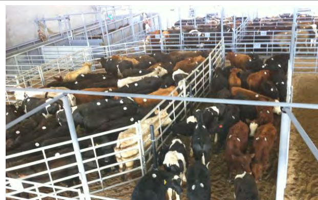
(Figures based on Mar. 2011- Dec. 2019)

OUR MISSION: We fund projects that Support, Foster and Encourage a Strong Ag-Economy in NC. Created in 2000, over 300 projects have been funded by the Commission. We currently manage over 40 active grant programs . These include projects such as crop research, farmer cost-share, job skills training, education, developing new ag markets, increasing Agri-Tourism patrons and more! 18 Ag Leaders serve on our Board of Directors and assist in selecting and awarding grant funds to our innovative projects. General Assembly appropriations fund the Commission, but the demand cannot be met! Each year, the Commission receives between $10-$12 million in requests. With so few funding options, viable agricultural, economic development and job training ideas go unfunded due to lack of grant resources!